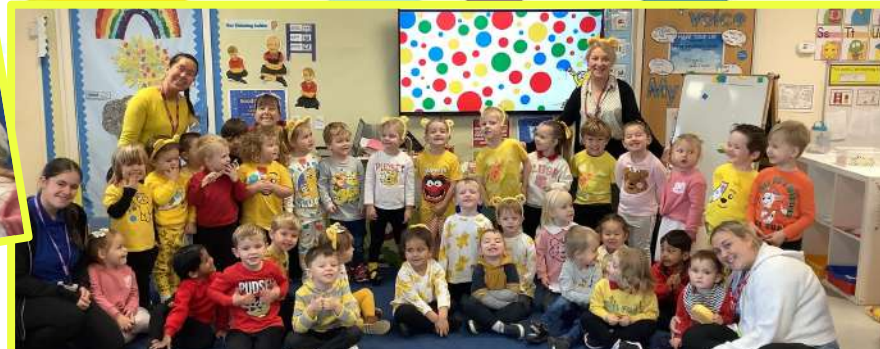
The children in Nursery have made a super effort dressing up for Children in need.