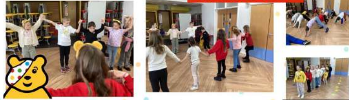
Active fun and games for Boost - with lots of smiling faces for Children in Need.