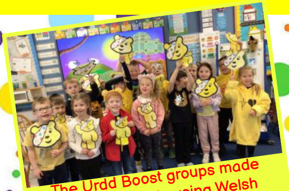
The Urdd Boost groups made Pudsey puppets using Welsh numbers and colours for Children in Need.