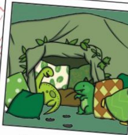
Indoor Autumn Den

Set up a cosy tent indoors using any frame you have (clothes horse, chairs, sofas, etc.) and some light fabrics. Decorate the inside with natural materials, hemp fabric, warm glow fairy lights, bubble lamps or even a homemade autumn garland (another good activity in itself!). It's a lovely place to enjoy the lights and sights of autumn and share stories.