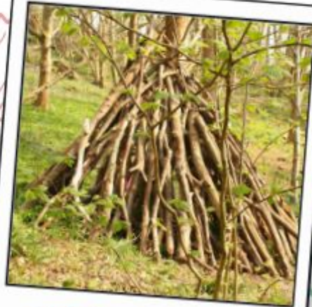
Outdoor Autumn Den

An alternative is to make an outdoor autumn den by hanging large pieces of fabric in your garden, maybe over some tree branches. Lay some soft blankets and cushions inside the cosy den and curl up inside. It's great to explore shadows and see how the light moves through the leaves.